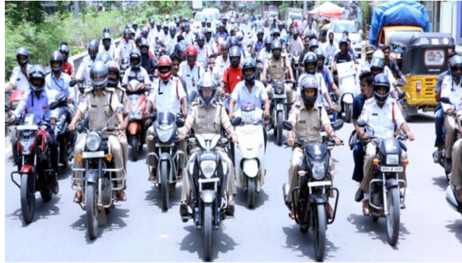
Fig.3.Helmet Safety Awareness

These problems can be solved by developing a Smart helmet. The Smart helmet proposed in this paper is integrated with an android application that can be used in the reporting of accidents. Additionally the helmet consists of pressure sensors that are used to determine the impact of the accident and uses cameras for recording the journey as well as to give a 360 degree view to the driver. When an accident occurs, the sensors present in the helmet transfer the sensor data through a raspberry pi to the application which further sends an alert message to the nearby hospitals as well as the close members whose numbers have been saved in the application. The helmet is also capable of generating light and sound to alert the nearby pupil of the accident.