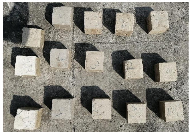
Fig. 4 casted specimens