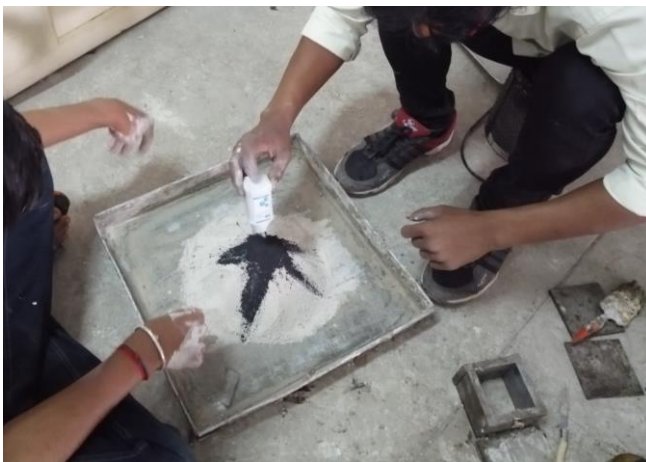
Fig. 3 preparation and mixing of materials

After 7 days of no curing the samples were tested for compressive strength. The speed of moving head of testing machine was kept less than 1mm per minute.