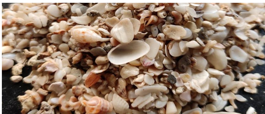
Fig. 1 shell waste

waste was finely powdered by small industrial grade crusher. Powder passing from 1.18 mm standard IS sieve was used further for mixing.