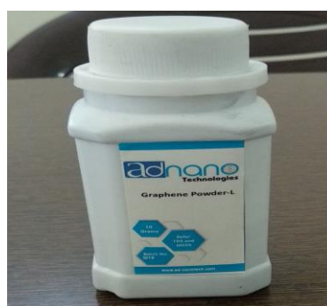
Fig. 2 Graphene-L

Fig. 2 shows Graphene-L that was used. It has pure low surface area. Graphene-L is derived by chemical exfoliation methods. The powder form of graphene was used to enable uniform dispersion of graphene in vedic plaster during dry mixing. The technical parameters of graphene used are tabulated in TABLE-I.