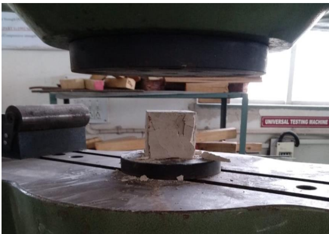
Fig. 5 cube testing