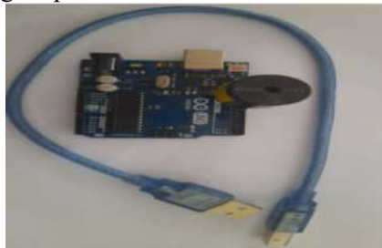
Fig. 5. Arduino Board with Buzzer

The buzzer is a sound-making device. We use the buzzer here to alert people nearby ATM counter about theft inside it. It is connected to digital pins of Arduino board.