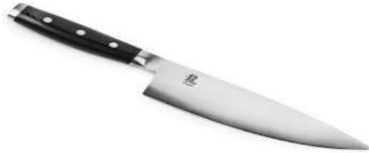
Fig. 1. Single Frames from Input Videos

We have used the You Only Look Once Version 3 (YOLOv3) prediction model for our project. The model which we have used was pre-trained on the COCO dataset. The model was modified and condition statements were added accordingly so as to predict weapon of interest that are specified previously depending on the region where the system is being deployed, like to predict knife of our current interest. This model has been designed to detect theft in real time from the footage of the surveillance cameras that have been set up in ATM.