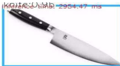
Fig. 2. Single Frames from Detected Videos

If this class label corresponds with one of the class labels that have been specified in the conditional statements, in our case, a knife, an alarm function is triggered. This alarm function generates a buzzer alarm on an Arduino board connected directly to the system and also on an Internet of Things (IoT) module that is not connected to the system directly, but works through an Application Program Interface (API) key that is used to access the module's cloud server that activates the buzzer through the internet, whilst the IoT module is linked to the BOLT Cloud site on the internet through any available wireless internet source such as Wireless Fidelity (Wi-Fi), that has been previously set to the module. Along with these Buzzer alarms, an alert in the form of SMS is also generated to inform required authorities.