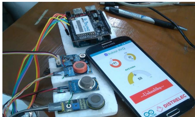
Figure 3: Device connected with Mobile Application