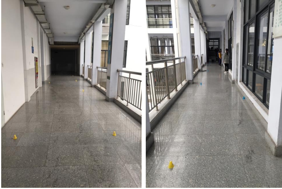
Figure 2. The Real Scene of Collecting Samples

The performance is measured by cumulative percentage of positioning error distance whose equation as follows: