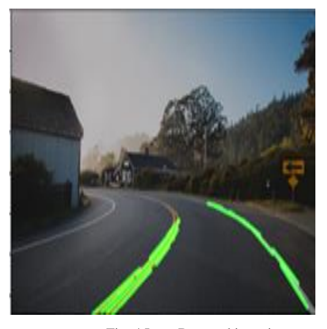
Fig. 4 Lane Detected in an image