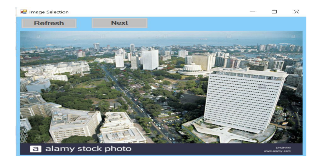
Fig. 2 software interface