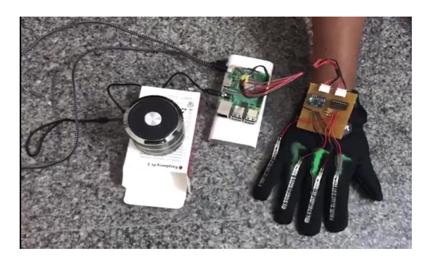
Fig. 2 PROTOTYPE USING THE ABOVE-MENTIONED SYSTEM AND COMPONENTS