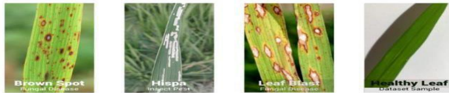
Figure1: Types of Paddy leaf Diseases