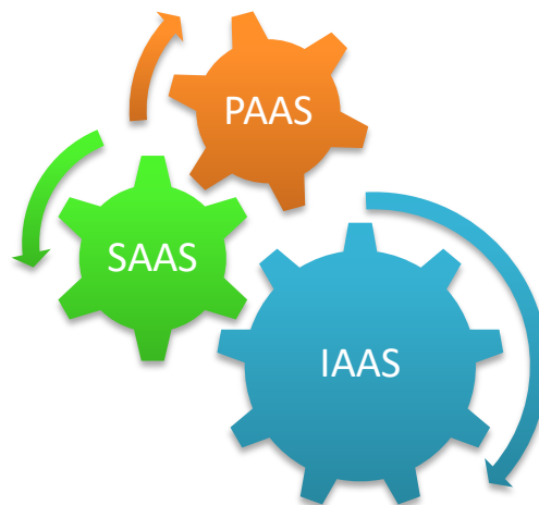
Figure (b): Cloud Service Models