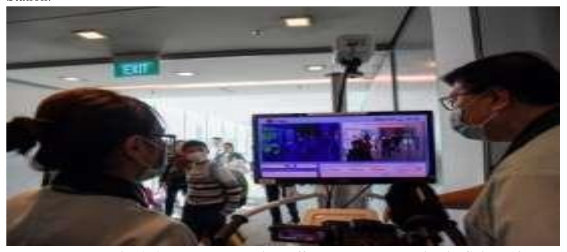
Fig. 1. AI based coronavirus affected person detection in China [13]

There are different ways in which people are making use of machine learning designs to detect or to fight against the COVID-19 virus. Below are the present applications of AI used in china and world to fight against COVID-19. The simple way to detect the coronavirus with AI is temperature sensing system implemented with cameras and thermal sensors. An AI system introduced by Baidu which is a Chinese Company uses an infrared sensor and AI to forecast people's temperatures is being used in China's Railway Station.