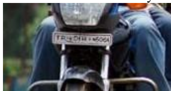
Number Plate Extraction Motorcyclist without Helmet