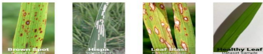
Figure1: Types of Paddy leaf Diseases