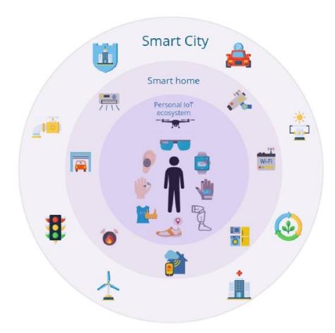
Fig. 2. IoT-empowered integrated smart environments [3]