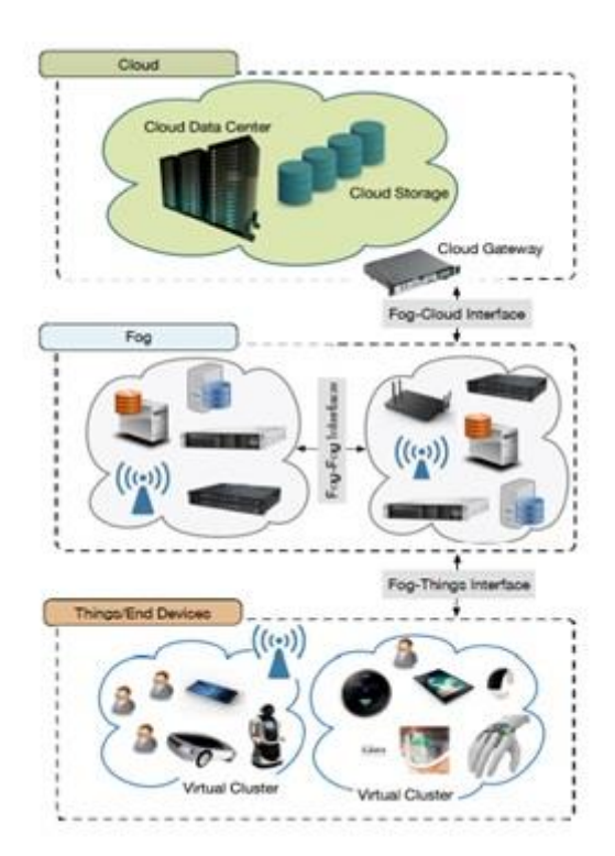
Fig. Error! No sequence specified. Fog basic architecture

Firdhous et al. (2014)[9] discussed the basics of fog computing issues stemming from cloud computing. FC developed as a result of problems in existing cloud and sensor networks in terms of latency, security, and processing speed. Fog computing, which is carried out by cloud computing, is centered around the region near the end-user network, or just above it, or very close to the edge of the cloud network.