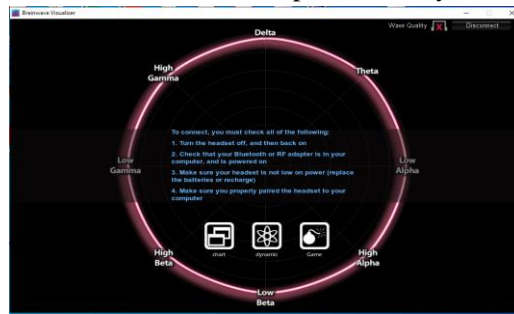
Figure 01: Brain signal calculation

Some sample outcome is as follows, the figure 02 shows the brain signal of chide with different ray's link alpha, beta, gamma etc. from that we can focus on particular rays to detect the LD,