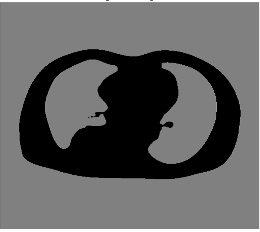
Figure 4 Segmented Lungs

illustrated more comprehensible, we additionally explain the color model transition method, the stages of the CLAHE methodology and control-law transformations. Segmented lungs