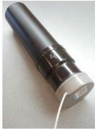
Fig.1 Finished Model