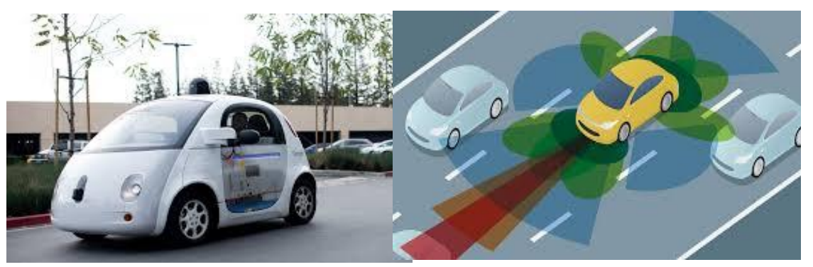
Fig. 1. Autonomous vehicles

It gathers the latest data within the discipline of the supply chain management and RFID techniques, with the combination of other latest Information technologies, are applied in automotive industry to achieve more efficient automotive industry in the area of low cost, low energy consumption and environmental protection[6].