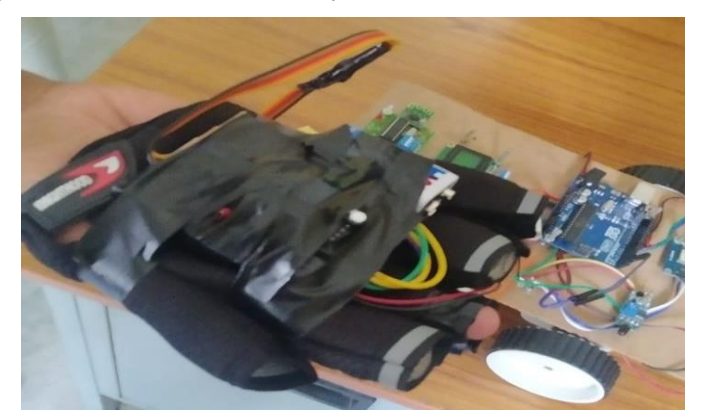
Fig.2 Fire detection alert by the bot

ZigBee module is placed in both in hand glove and Bot. The transmitter will be placed in the hand glove and the receiver is placed in the bot. According to the movements in the hand glove the bot will respond to that. The fire flame sensor which is placed in the bot will detect the intensity of the fire in the remote area. Arduino UNO will control the actions of the sensor and act as the CPU. Fig.2 shows the hardware circuitry of the fire detection alert by the bot.