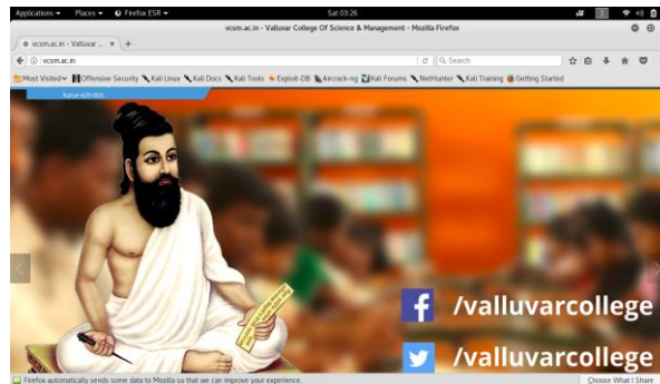
Figure 1 : Home page