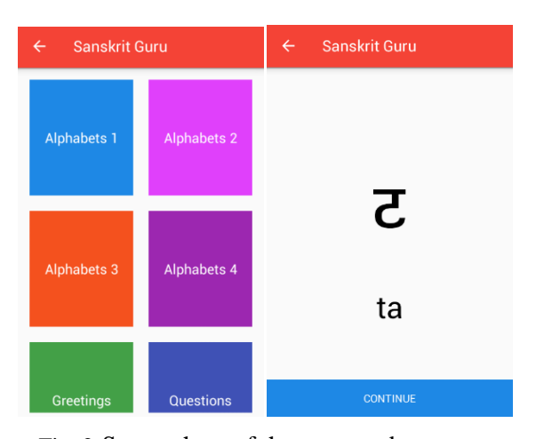
Fig. 2. Screenshots of the proposed sytem

Here provided are three screenshots of the proposed system Sanskrit Guru. The system assumes that the learner is beginner and is not aware of the Sanskrit Language at all. The application is for English Speakers. The learning will start from the basic letter and then compound letters, then slowly words will be introduced. The user can learn the language at own pace anywhere as per their convenience.