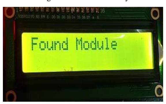
Fig 3: Shows Module Found