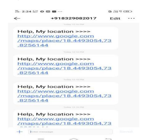
Fig 2: Shows Status Of System