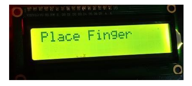
Fig 4: Asks to Scan a Finger

Tracing Location on the Map: System user can see the vehicle position. The user can see the reports of vehicle speed, ignition status and travelling report. The user must enter the username and password provided at the time of authentication. An internet connection is necessary for reading the vehicle information and the reports of the tracking. A strong communication network is necessary for maintaining the efficiency of the system. To show tracking of the vehicle and position Google maps system is used. An appropriate geographical location is plotted on the basis of available coordinates this will help company unit and police to trace the vehicle. Fig 6. Shows how the location