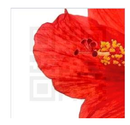
Fig4. Encrypted Secret Image using