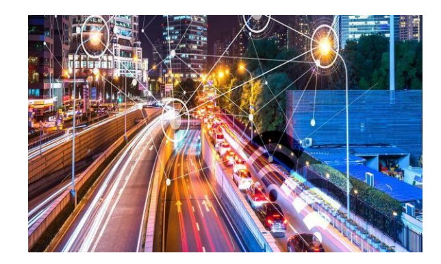
FIG.3 SMART HIGHWAYS

So this paper basically approaches that whenever a new or existing citizen visits the Road they will get all the information on their smartphone with WAU smartapp. It will help the visitor to get the proper destination on time with all the details of the road. The information the roads will be stored on the local server which will be installed on the particular area with all the information of the road. It will display various information like the speed limit, nearby medical facility, name of the road. Shortcuts connected to the roads with precise loction with local servers provided by the local authority.