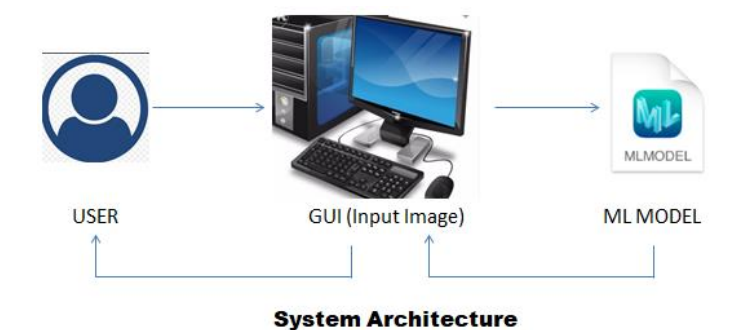
Figure no 1: System Architecture

The proposed system is illustrated in Figure no: 1.