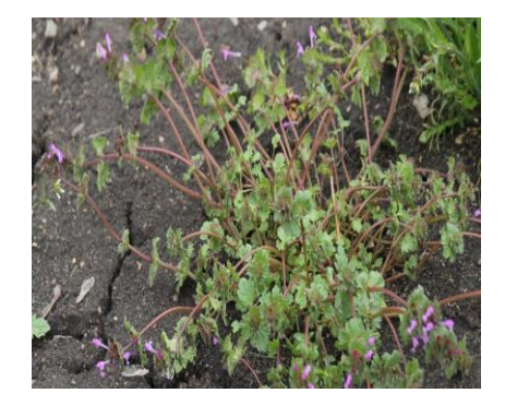
Fig 1: Annual Weed

Weeds serve as an important source of genetic materials for crop improvement such as breeding for resistance to pests and diseases which are made possible by genetic materials provided by wild species of the crop plants. Weeds reduce farm and forest productivity, they invade crops, smother pastures and in some cases can harm livestock. They aggressively compete for water, nutrients, and sunlight, resulting in reduced crop yield and poor crop quality. Some weeds are a potential threat to the existing crop. This is one of the main reasons that weed detection in farms plays an important role in the agricultural field. Distinguishing between the good and bad weeds manually is a tedious task. The manual work of detecting weeds is very timeconsuming. There are three types of weed namely Annual Weeds, Biennial Weeds and Perennial Weeds. Annual weeds germinate and spread by seed, having an average lifespan of one year. Biennial weeds develop from seed and complete their life cycle in two years. Perennial weeds produce long taproots in addition to seeds and it occurs every year.