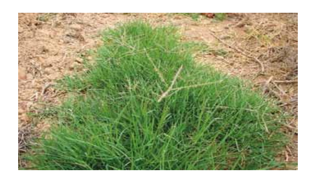
Fig 3: Perennial Weed

Perennial weeds produce long taproots in addition to seeds and it occurs every year. There are two stages of perennial weeds. Those are Broadleaf and Narrow-leaf stage. The broadleaf is the stage where the weeds have wider leaves in addition to its roots. The narrow-leaf is the stage where weeds have longer leaves in addition to its roots. Prevention of the perennial weeds is done by using closed planting technique.