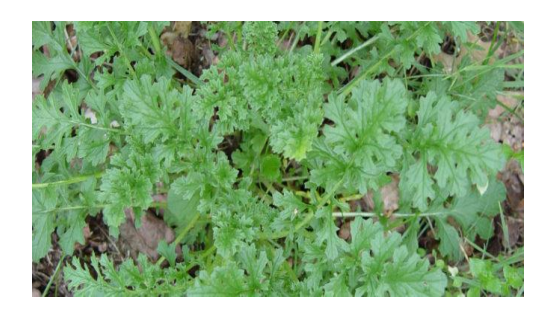
Fig 2: Biennial Weed

Annual weeds germinate and spread by seed, having an average lifespan of one year. It has two stages; Summer annual and Winter Annual. Summer annual weeds generate in spring and die in fall. Winter Annual weeds generate in fall and die in spring. Prevention of the Annual Weed is done by using herbicide.