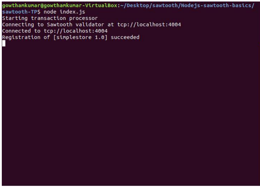
Figure 4. Registration diagram

export PATH=<path to download location>/bin:$PATH