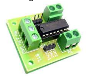
Figure 6.3 Motor Driver

The Motor Driver is used to control the working speed and direction of two motors simultaneously. This Motor Driver is inbuilt with L293D IC. It has a 16 Pin. Bidirectional current will flow at voltages from 5 V to 12 V. Motor Driver is given a below in Figure 6.3. It performs on the concept of H-bridge. Due its size, it is mostly used in robotic application for controlling DC motors.