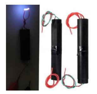
Figure 6.5 Electric Arc Generator