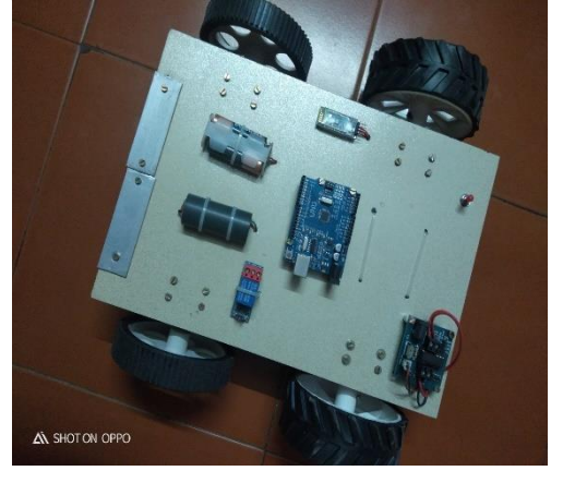
Figure 8.1 Prototype of proposed system

This project is designed to establish a robotic vehicle for remote area operations and which is attached to a IP wireless camera for monitoring purpose. The robot can transmit audio visual data such as videos or photos in real time. The wireless robot can be useful for under cover purpose in battle fields. And this is the first of its kind robot which is equipped with power arc device which can give an electric shock of 20 KV range. Location of terrorists can suitably be revealed using such robot. The prototype of this proposed system is mentioned in the below Figure8.1.