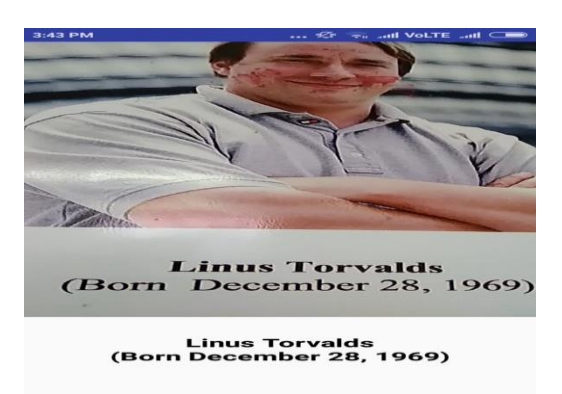
Fig 4.Text Reader