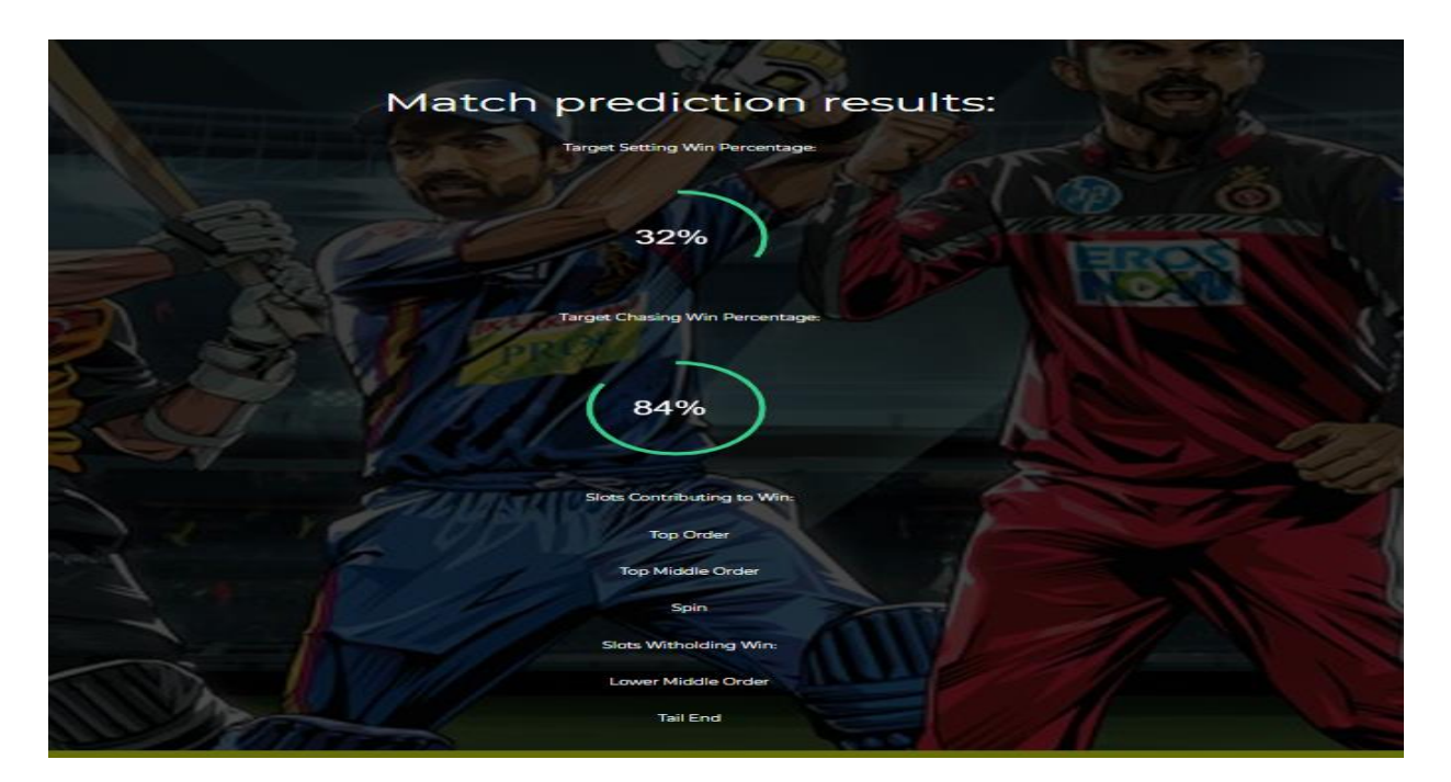
Fig 7.1: Prediction Output